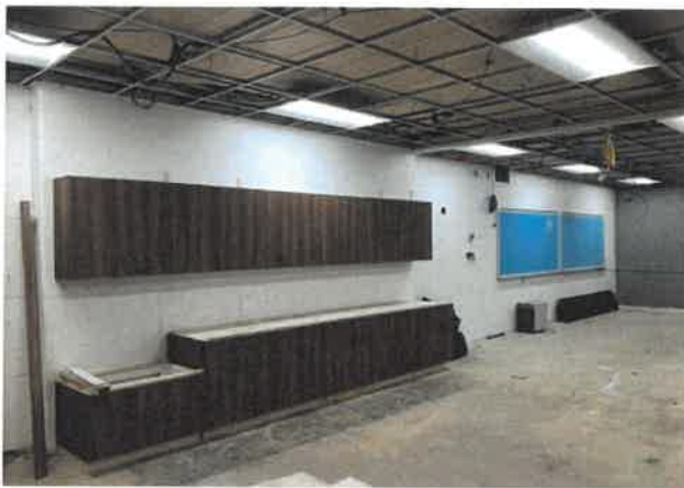
Wittenberg Elem New Cabinetry and Lights Installed