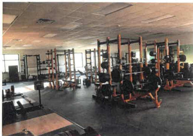
HS Weight Room