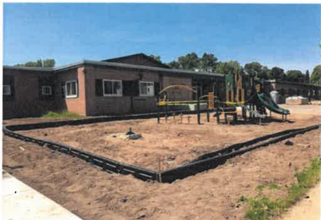
Birnamwood Elementary Playground