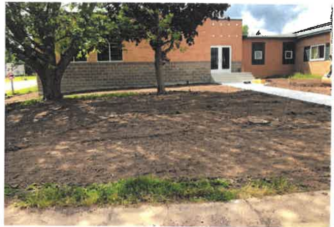
Birnamwood Elem Topsoil Spread and Ready for Landscaping