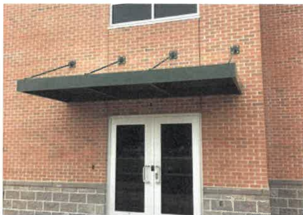
Wittenberg Elementary Addition Entrance