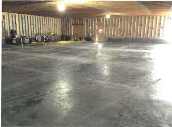
High School Enviro Building