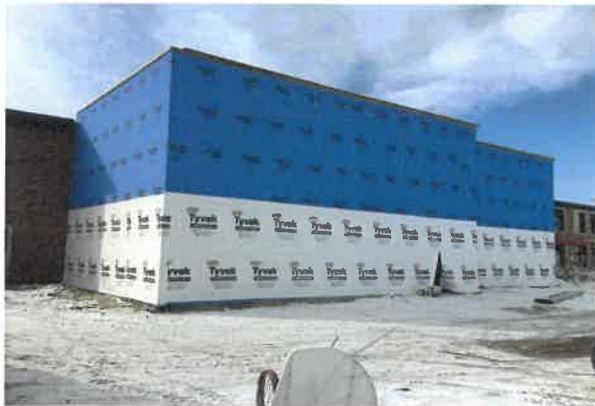
Wittenberg Elem enclosed and heated