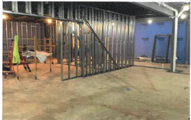
Birnamwood Elem interior framing