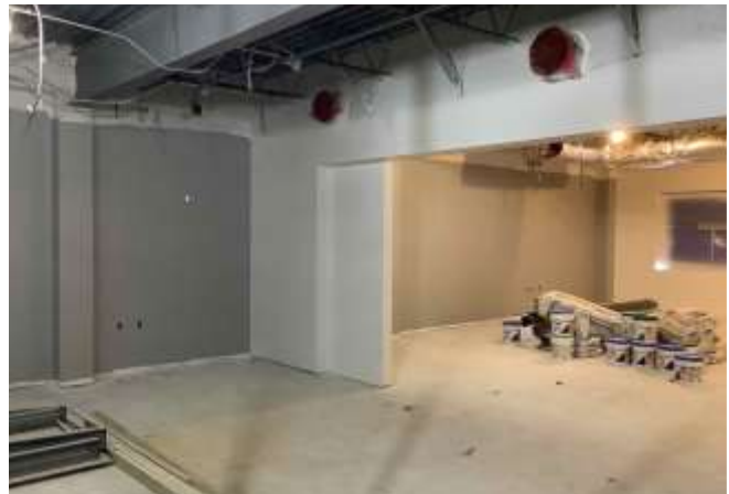
Birnamwood Elem Finish Painting