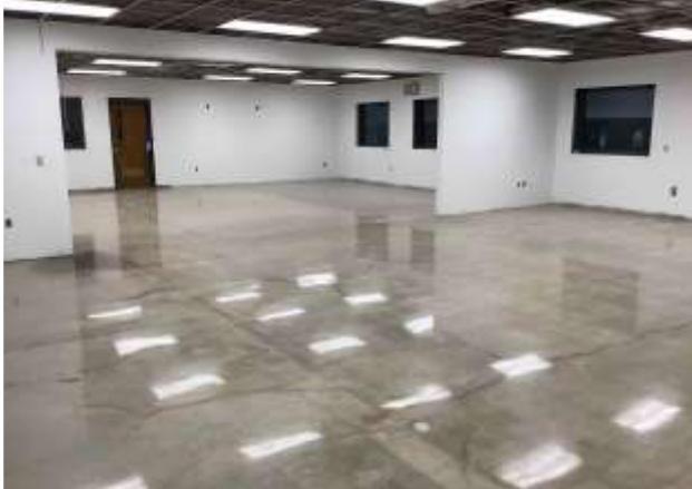
High School Finished Floors