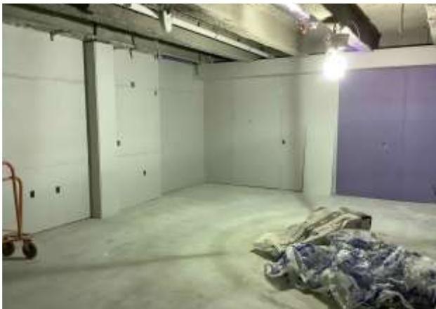
Wittenberg Elem Drywall Installation