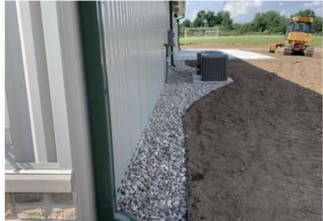
Ag Building Stone Landscaping