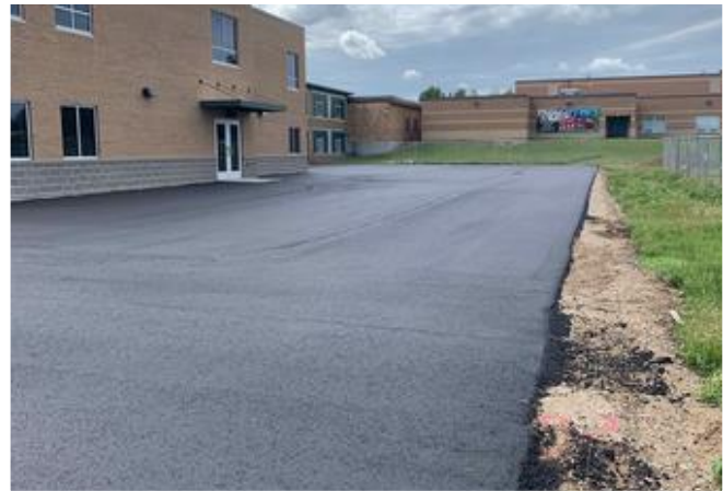
Wittenberg Elementary Asphalt (1 st layer)