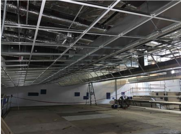
HS New Auditorium Ceiling

Week of July 13 th , 2020 - Wittenberg Birnamwood Schools