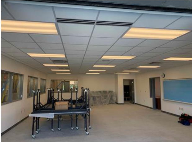
Ag Building Interior Finishes

Week of August 3 rd , 2020 - Wittenberg Birnamwood Schools