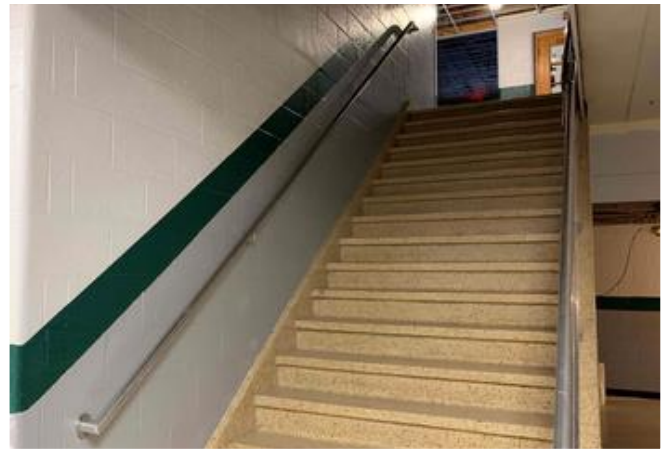
Witt Elem Stairwell Painting