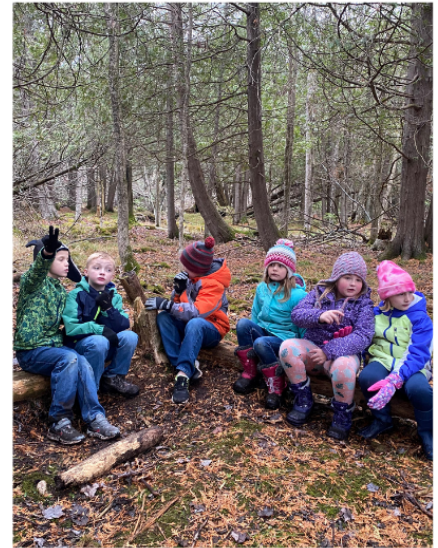
We always begin our Explorer Days with a nature hike to get to know our surroundings and tune into our senses.

December Goal: I will make predictions about how animals are adapting to survive the cold, dark, winter season.