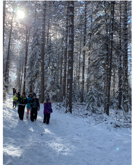
Enjoying the beauty of winter!

We have been having some mild winter weather these past few months. However, being ok during a 15 minute recess without snowpants and boots is completely different than being outside for 2-3 hours on explorer days. Please prepare your students for the weather by sending the proper gear! Cold hands and feet are no fun...please send waterproof mittens and boots on Explorer Days. There is no such thing as too "cool" to be warm. Spring is ahead, plan for all temperatures, as well as lots of mud and water!