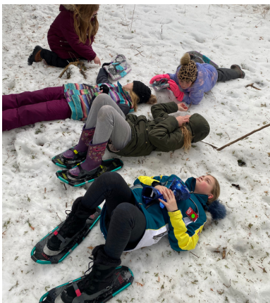
Snowshoeing...fun yet exhausting!

Analyzing animal sign means telling the story of what the animal is doing without even seeing the actual animal! We learned that if there are frost crystals around an opening there is something warm breathing inside...I wonder what it could be?