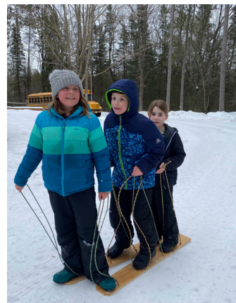
Silly winter Olympics...group ski!