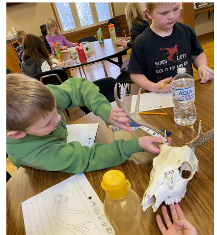
Drawing, writing and measuring are all part of Nature Journaling.