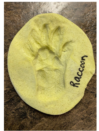
Making tracks prints in playdough