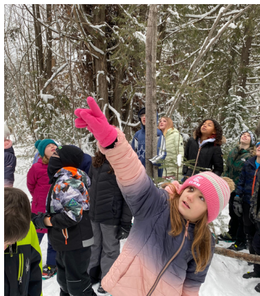
We have a porcupine at the school forest that some classes are lucky enough to see!